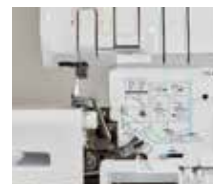
4 colour easy threading guide