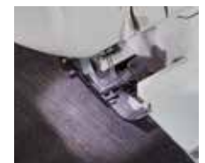
LED work light