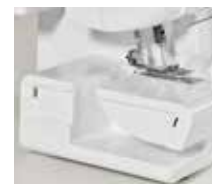
Free arm/Flat bed convertible sewing surface