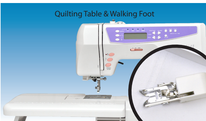
Quilting Table & Walking Foot

Large Quilting Extension Table and Walking Foot.