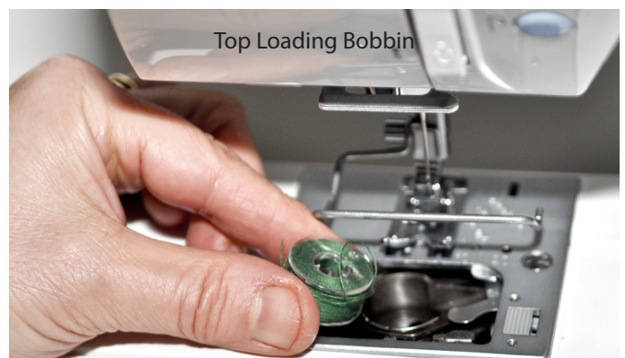
Top Loading Bobbin