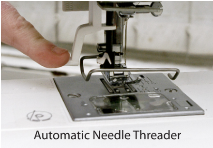
Automatic Needle Threader

From the whisper quiet top loading bobbin and automatic tension unit to the built in needle threader and one step buttonholes - lots of user friendly, labour saving features which allow you more time to concentrate on your sewing.