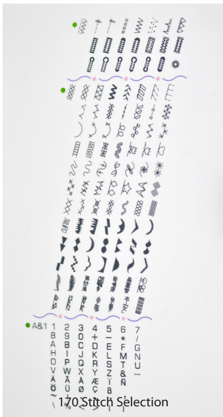
170 Stitch Selection