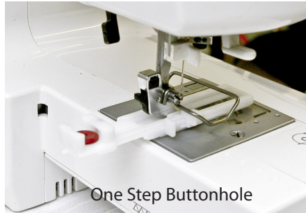
One Step Buttonhole