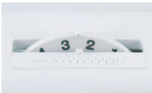
STITCH WIDTH & NEEDLE POSITION ADJUSTMENT