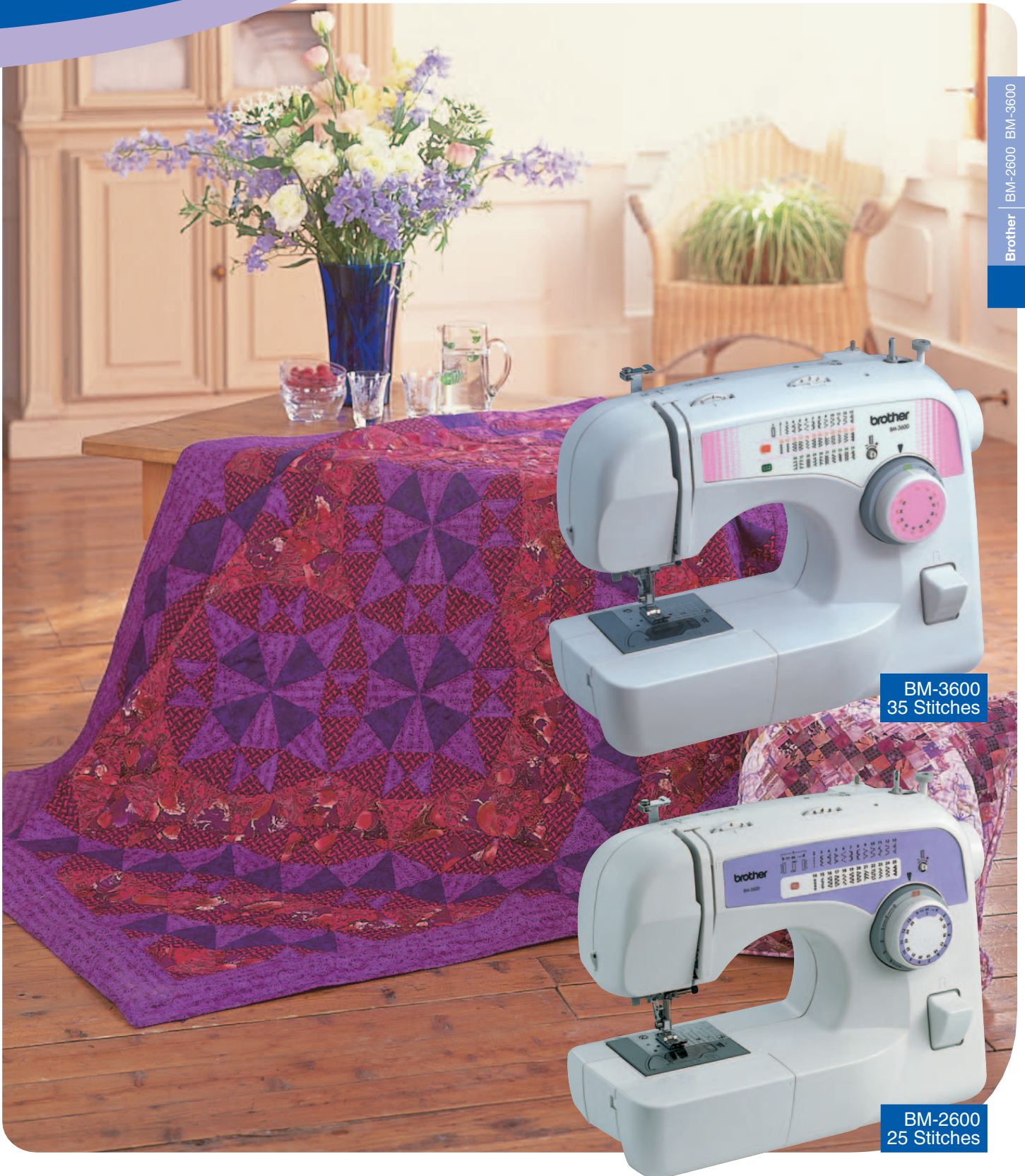
BM-3600 35 Stitches