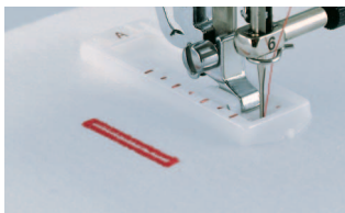
4-STEP AUTOMATIC BUTTONHOLER