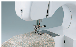
FREE ARM SEWING