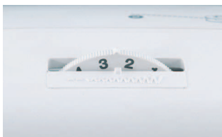
STITCH WIDTH & NEEDLE POSITION ADJUSTMENT